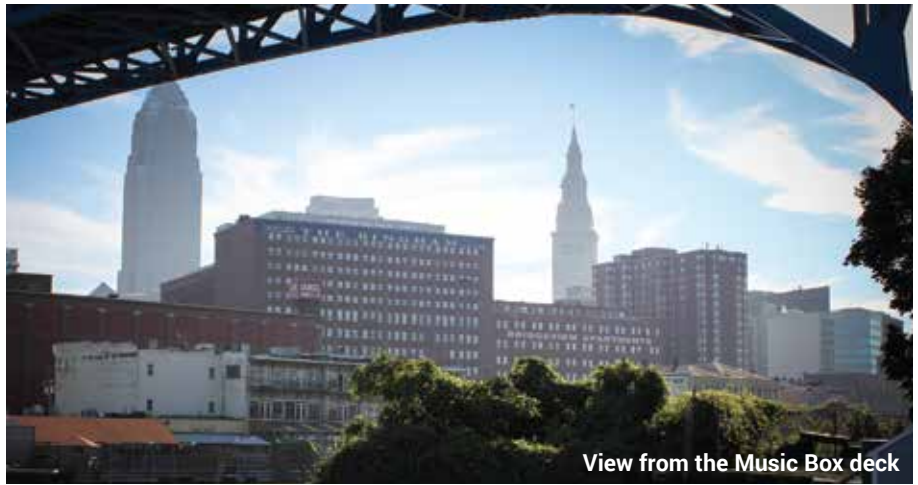
View from the Music Box deck